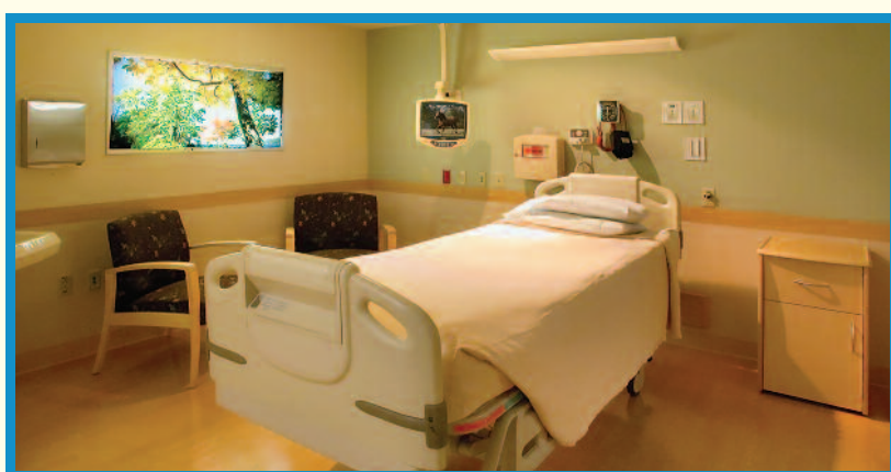
A private bed in the new Sipe Infusion Center.

The results include 11 heated treatment chairs that also provide a soothing vibration to the lower back. Each chair also comes with its own flat-panel television. Patients also have access to the Internet. Treatment areas are separated by privacy walls outfitted with frosted windows that patients can slide open if they wish to converse with patients in adjoining areas. In addition to the 11 treatment chairs, the center includes four private beds for patients.